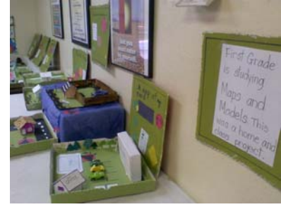
Maps and Models