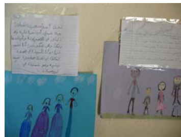
3rd Grade Family Projects