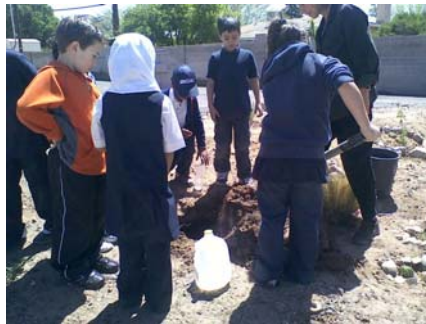
We Love Gardening

Second Grade is working very hard on many different things. In Science we are studying all about animals. We are learning about mammals, fish, reptiles, birds, amphibians, and insects. We are having a good time and finding this very interesting. In Social Studies we have been learning about the different land forms on the