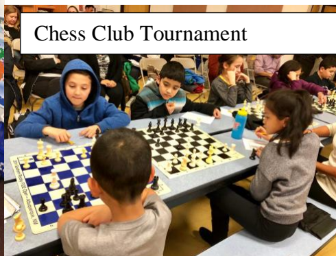
Chess Club Tournament