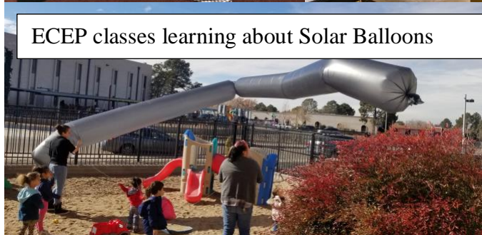
ECEP classes learning about Solar Balloons

Congratulations to our School Science Fair Winners as well as the 5 4 th /5 th graders and 13 Middle Schooler who qualified for Regional Science fair.