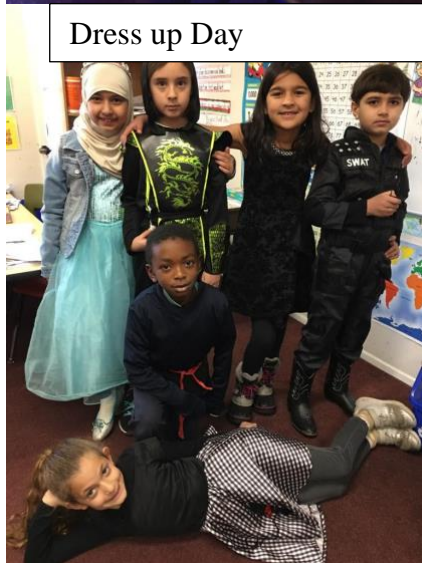
Dress up Day