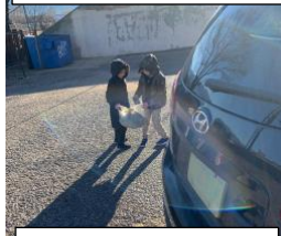
1 st grade cleaning up around the school