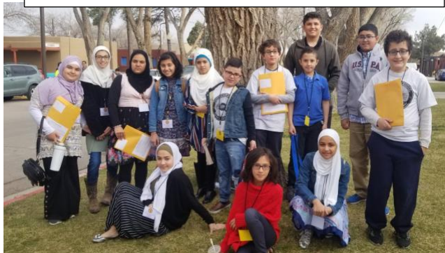
Central New Mexico Regional Science Fair