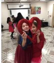
Girls and Boys Party. Thank you, PTO!