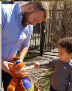
Health Week Dental Day