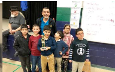
Elementary Chess Team Tournament