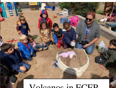
Volcanos in ECEP