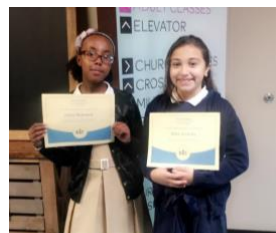
Regional Spelling Bee Qualifiers

May 2 nd : You're invited to watch the all school Talent Show!!! @9am