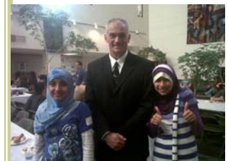
NASA Event at UNM